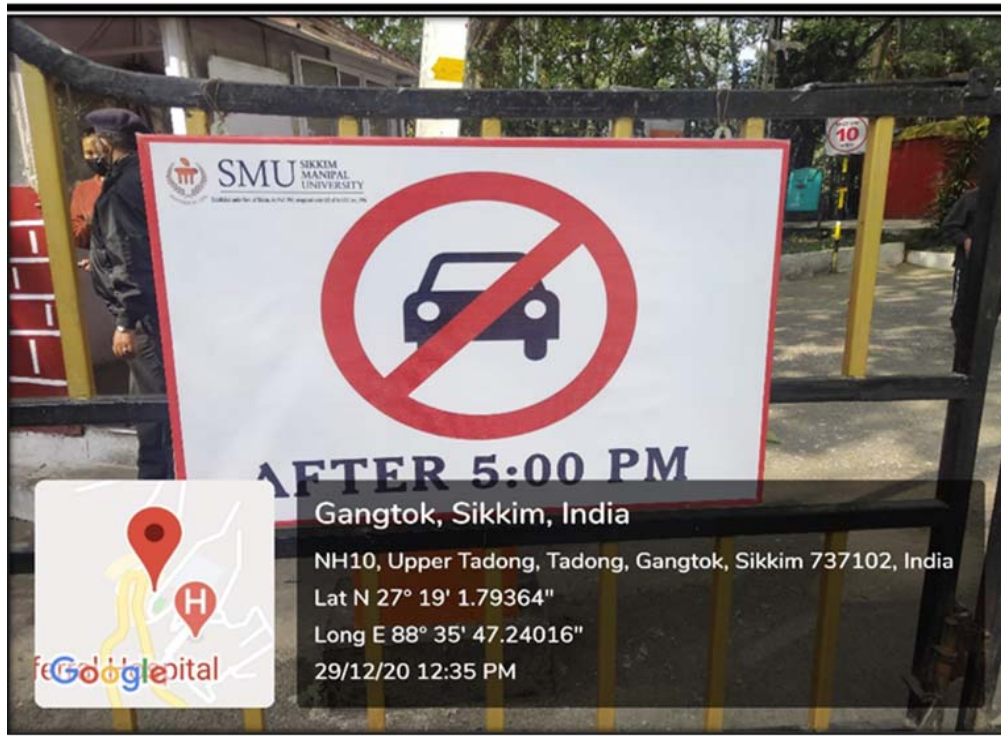
Restricted entry of vehicle after 5:00 PM